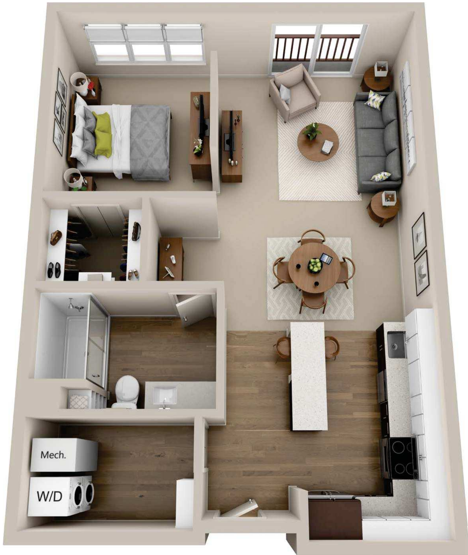
Garrison Court | Unit SB2 734 Square Feet | Studio